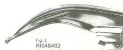
Fig. 2 RI048402 Conventional RI048402F Fiber optic