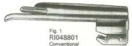
Fig. 1 RI048801 Conventional RI048801F Fiber optic