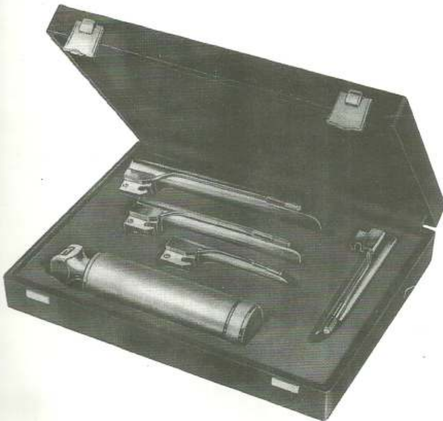
Foregger RI049200 Conventional laryngoscope set with medium handle Set of 4, Fig. 1-Fig. 4