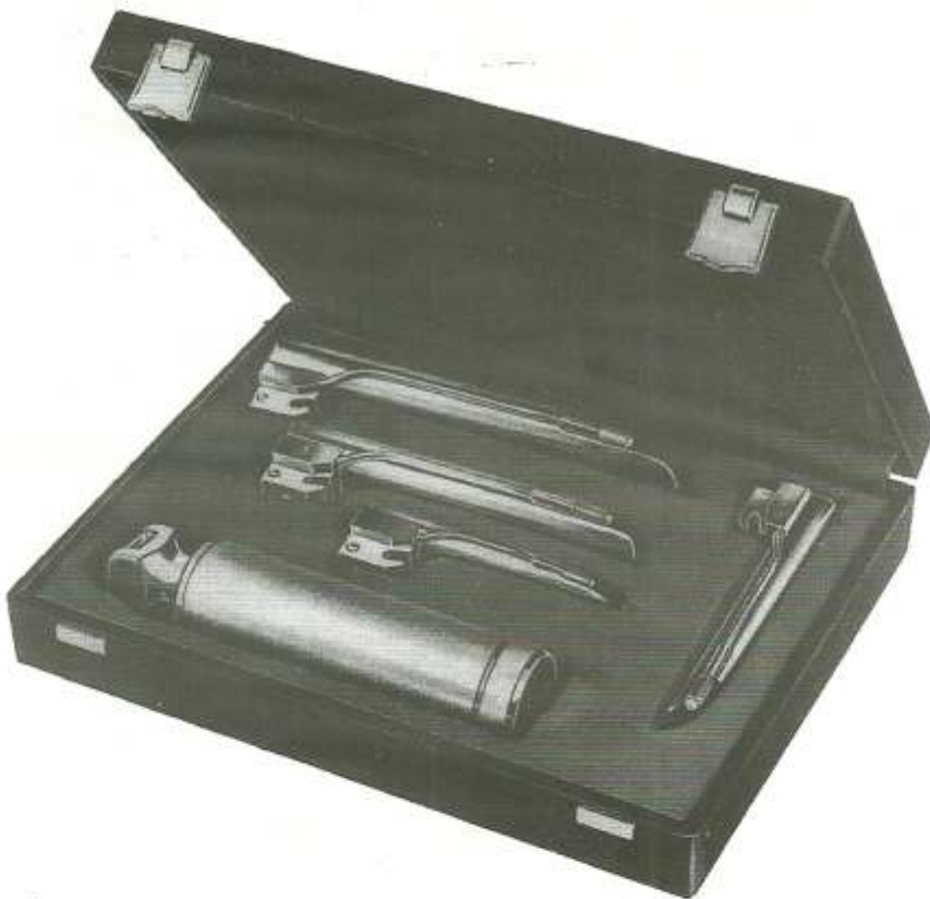
Guedel-Negus RI046200 Conventional laryngoscope set with medium handle Set of 4, Fig. 1-Fig. 4 RI046200F Fiber optic laryngoscope set with medium handle Set of 4, Fig. 1-Fig. 4