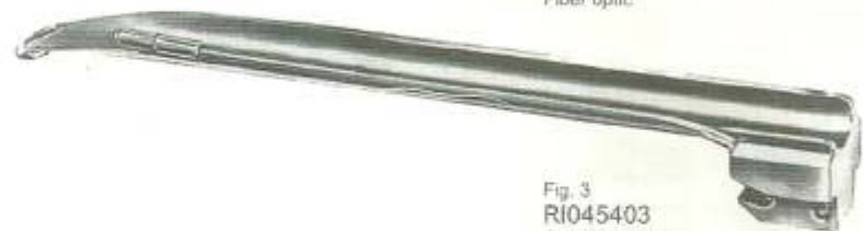
Fig. 3 RI045403 Conventional RI045403F Fiber optic