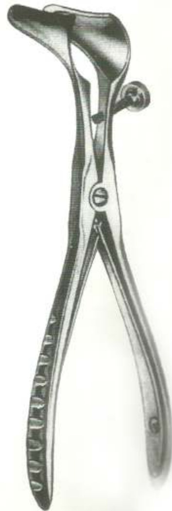
Killian 13 cm / 5"