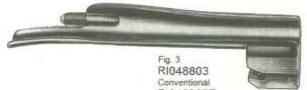
Fig. 3 RI048803 Conventional RI048803F Fiber optic