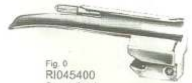
Fig. 0 RI045400 Conventional RI045400F Fiber optic