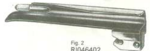
Fig. 2 RI046402 Conventional RI046402F Fiber optic