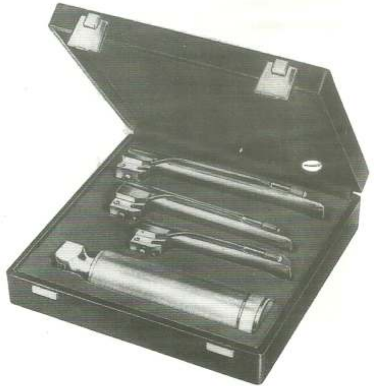
Guedel-Negus RI046100 Conventional laryngoscope set with medium handle Set of 3