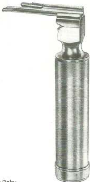
Miller-Baby RI045300 Conventional laryngoscope set with medium handle Set of 2, Fig. 0-Fig. 1 RI045300F Fiber optic laryngoscope set with medium handle Set of 2, Fig. 0-Fig. 1