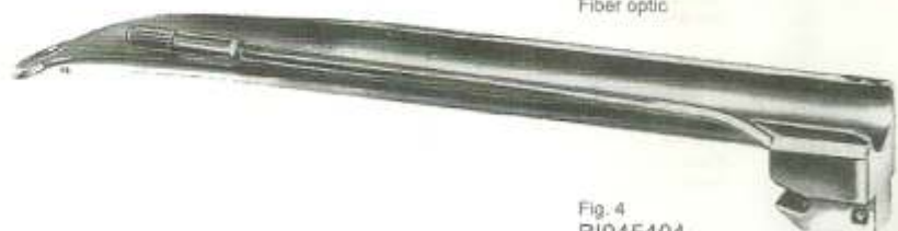
Fig. 4 RI045404 Conventional RI045404F Fiber optic