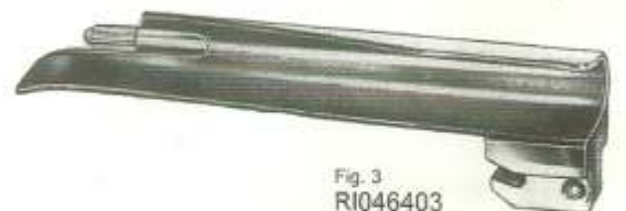
Fig. 3 RI046403 Conventional RI046403F Fiber optic