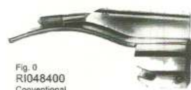
Fig. 0 RI048400 Conventional RI048400F Fiber optic