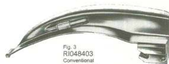
Fig. 3 RI048403 Conventional RI048403F Fiber optic