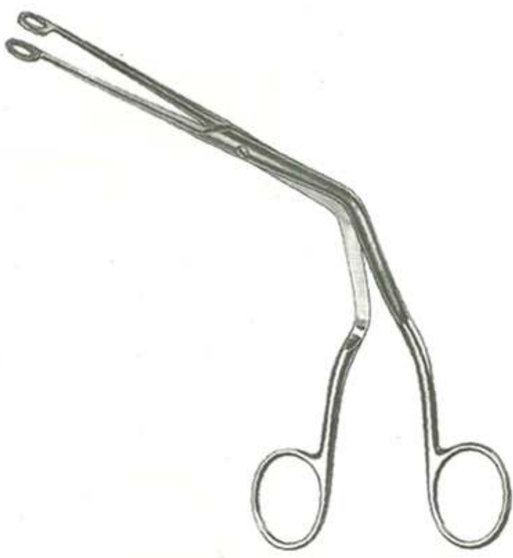
Magill Catheter introducing forceps