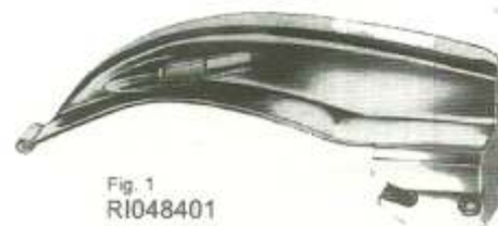
Fig. 1 RI048401 Conventional RI048401F Fiber optic