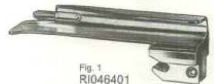
Fig. 1 RI046401 Conventional RI046401F Fiber optic