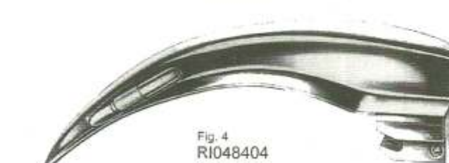
Fig. 4 RI048404 Conventional RI048404F Fiber optic