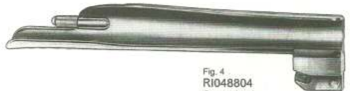
Fig. 4 RI048804 Conventional RI048804F Fiber optic