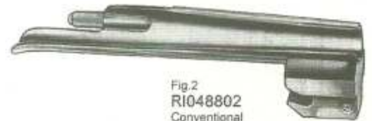
Fig. 2 RI048802 Conventional RI048802F Fiber optic