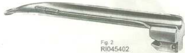
Fig. 2 RI045402 Conventional RI045402F Fiber optic