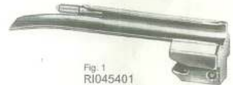
Fig. 1 RI045401 Conventional RI045401F Fiber optic