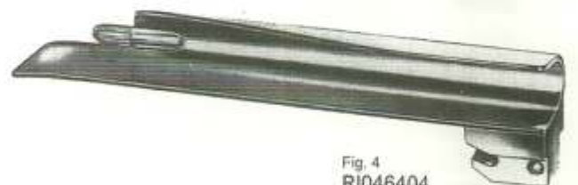
Fig. 4 RI046404 Conventional RI046404F Fiber optic