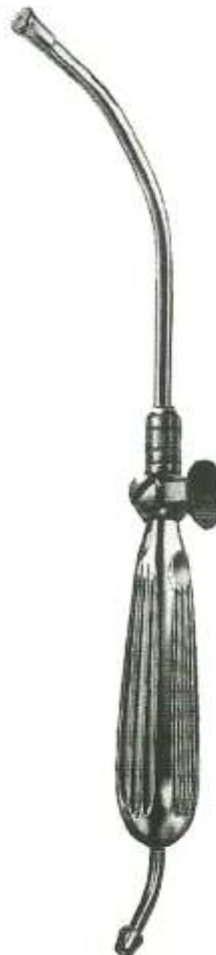
Yankauer R H200100 Stainless steel R H200101 Chrome plated