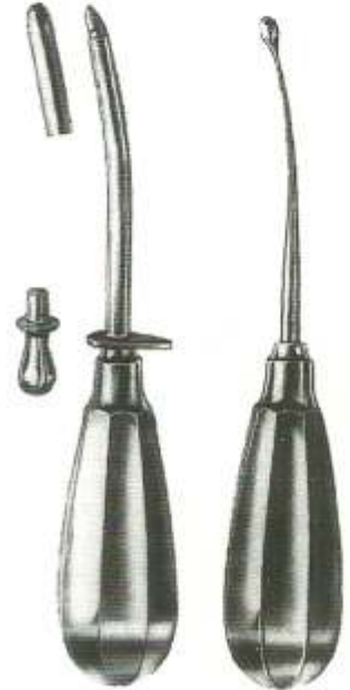
Krause RH060655 5.5 mmø Antrum trocar, with obturator and tubing connection