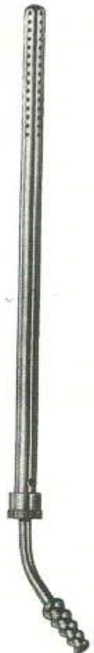
Poole R H065222 22 cm / 8 1/2", 8 mm (Fr 23) Stainless steel