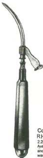
Coakley RH061622 2.25 mmø Antrum trocar, with obturator and tubing connection with washing tube and fixed tubing connection