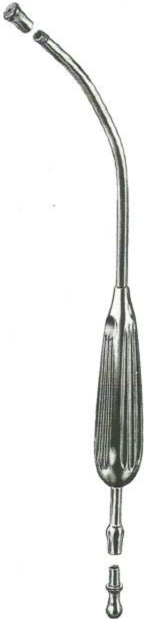
Yankauer R H064423 23 cm / 9" R H064427 27 cm / 11" Stainless steel R H200123 23 cm / 9" R H200227 27 cm / 11" Chrome plated