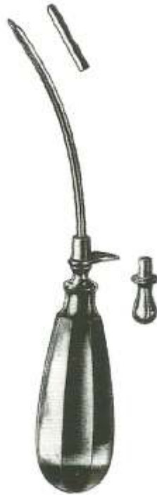
Pierce RH059603 3 mmø RH059604 4 mmø RH059605 5 mmø