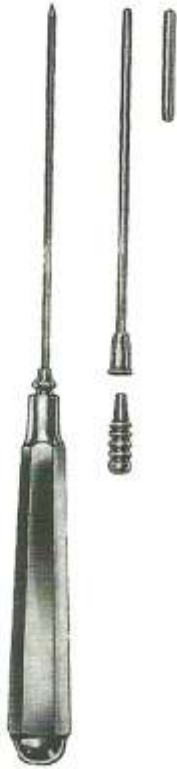
Lichtwitz RH059118 1.8 mmø