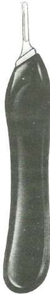
RZ021304 No. 3 Plastics