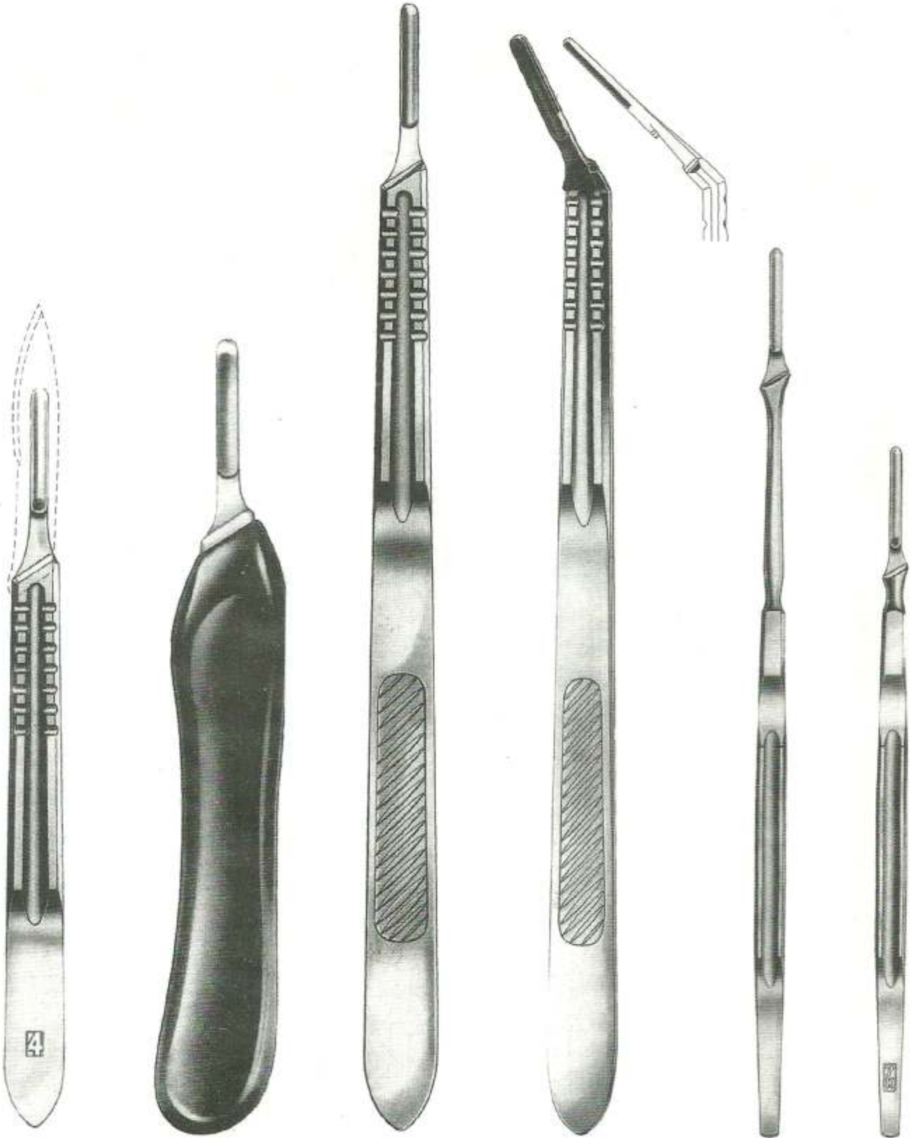
Standard RAZ020104 No. 4 Solid