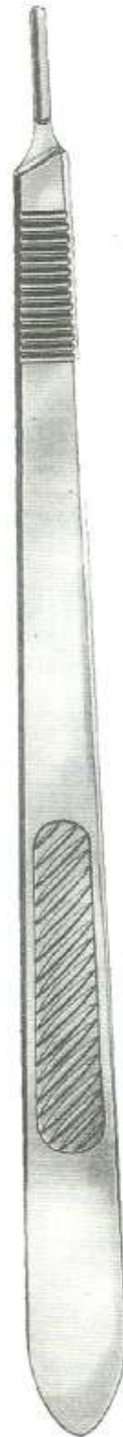
RZ023431 No. 3L Solid, straight