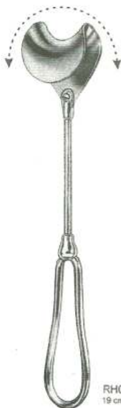
RH035619 19 cm / 7 1/2"