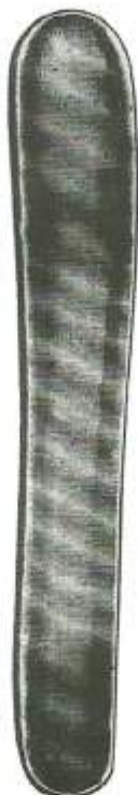
Buchwald RH046217 17 cm / 6 3/4" Acrylic glass