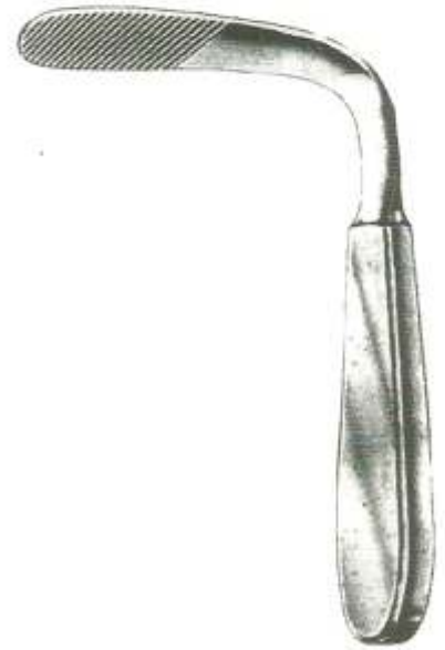
Tobold RH038214 14.5 cm / 5½"