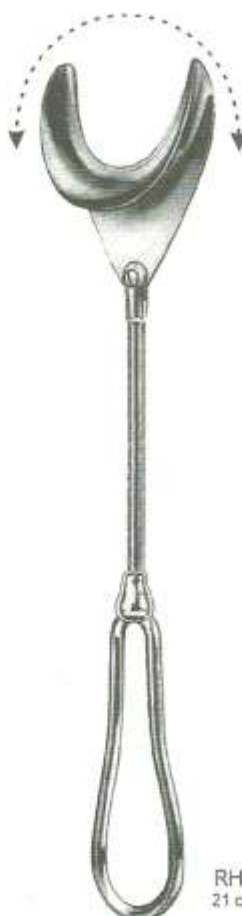
RH035821 21 cm / 8 1/4"