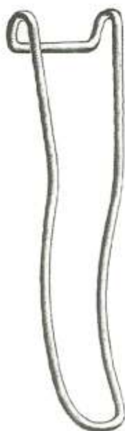
Sternberg RH034814 14 cm / 5 1/2" RH034816 16 cm / 6 1/4" RH034818 18 cm / 7"