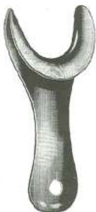
Simplex RH034411 11 cm / 4 1/2"

Cheek and Lip Retractors, Tongue Depressors Wangen-und lippenhalter, zundendrucker Separadores para labios y mejillas, abaja-lenguas