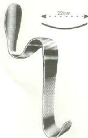
Bishop RH036213 13 cm / 5"