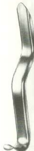
Cawood-Minnesota RH036415 15.5 cm / 6" Without fiber optics