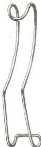
Sternberg RH035012 12 cm / 4 3/4" RH035014 14 cm / 5 1/2" RH035016 16 cm / 6 1/4"