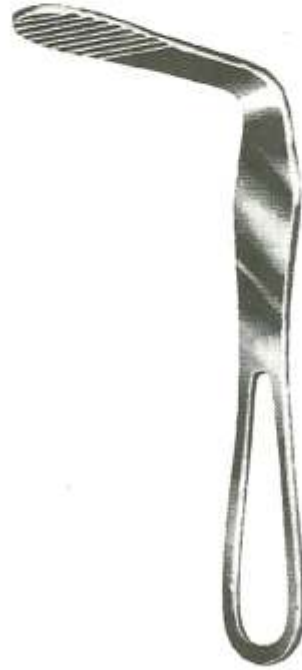
Hartmann RH037215 15 cm / 6"