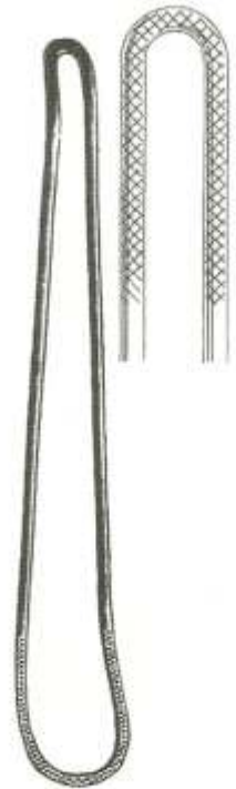
Frenzel RH049816 16.5 cm / 6 1/2"