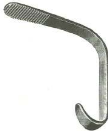
Andrew RH039411 11 cm / 4½"