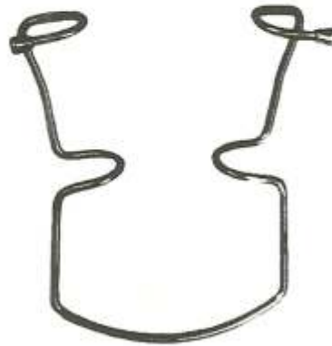
Oringer RH034113 Fig. 1-3 set