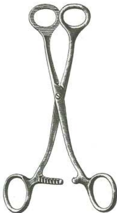
Collin RH201016 16 cm / 6 1/4" RH201017 17 cm / 6 3/4" RH201019 19 cm / 7 1/2"