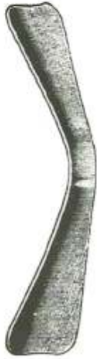
Doyen RH047613 13 cm / 5" RH047616 16 cm / 6 1/4"