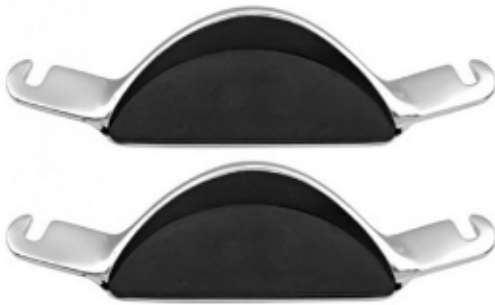
Equine Mouth Speculum Di-0015

Rubber Fitted Extra Wide Bite Plates Special rubber layer insertion provides protection against the chipping and slippage of the incisors. The extra wide arms keep the speculum away from the equine's cheek making more working space for the technicians to use various angles to access the horse's mouth. For use with the Millennium speculum, the SE Speculum or the Hausmans.