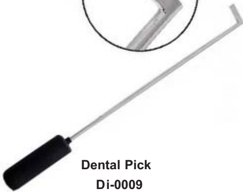
Dental Pick Di-0009