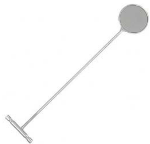
Dental Mirror Di-0005

50mm Diameter Mirror (Straight) Dental mirror for examination purposes of equine mouth.