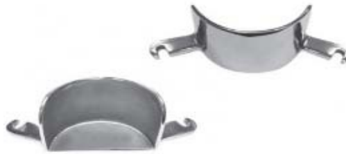
Equine Mouth Speculum Di-0016

Rubber Fitted Extra Wide Bite Plates Special rubber layer insertion provides protection against the chipping and slippage of the incisors. The extra wide arms keep the speculum away from the equine's cheek making more working space for the technicians to use various angles to access the horse's mouth. For use with the Millennium speculum, the SE Speculum or the Hausmans.