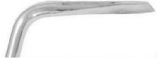
Dental Pick Di-0008

(Anterior Posterior) Short Head Dental Pick For anterior and posterior use when elevating tissues around molar teeth, usually