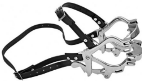
Equine Mouth Speculum Di-0024

Millennium Speculum with Biothene Straps Premium quality speculum has deep but small ratchet settings to ensure a comfortable fit on each individual horse. It can be fitted with normal or extra wide bite plates. Comes with hardwearing biothene straps which are water proof and easy to clean. Available in normal or extra wide bite plates.