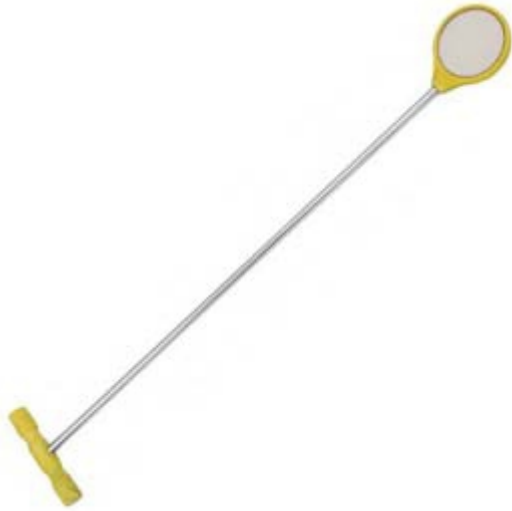
Dental Mirror Di-0001

50mm Diameter 25D Value Range Mirror New A new design equine dental mirror with silicon coated framed head and T handle. The shaft of the mirror is made up of stainless steel. Due to the combination of various materials this mirror is valued at a very competitive price.