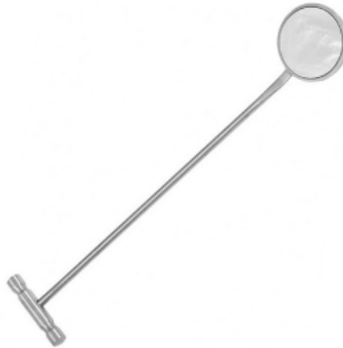
Dental Mirror Di-0002

50mm Diameter 25D Value Range Mirror New A new design equine dental mirror with silicon coated framed head and T handle. The shaft of the mirror is made up of stainless steel. Due to the combination of various materials this mirror is valued at a very competitive price.