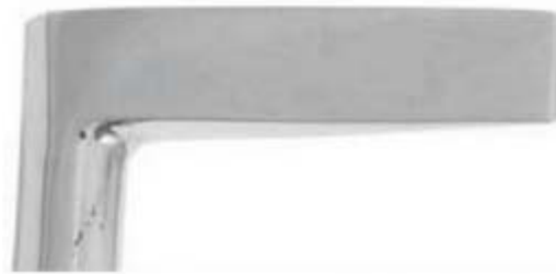
Dental Pick Di-0010