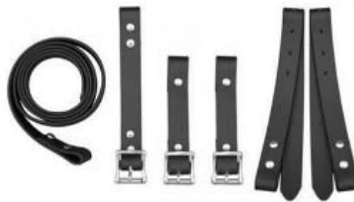
Equine Mouth Speculum

Biothene Straps Biothene straps are hard wearing, flexible and easy to use with all types of speculums. Assembled with high quality brass buckles and rivets. Easy to attach to the speculums with the help of screws supplied with the straps.