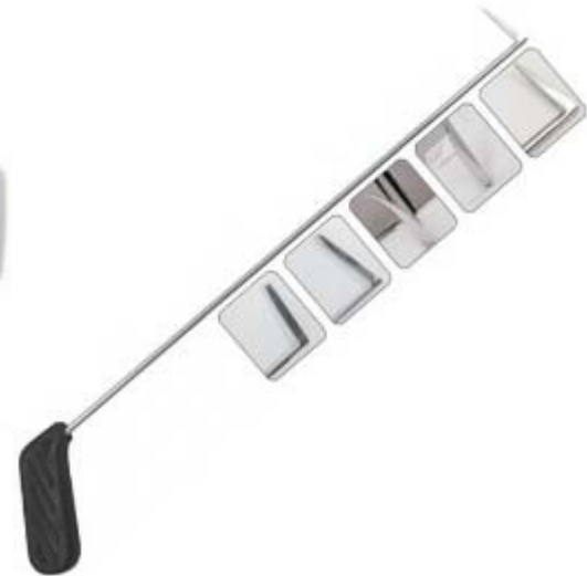
Dental Pick Di-0011