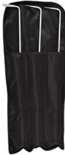
Dental Pick Di-0007

Lingual Buccal Long Head Dental Pick Its lingual and buccal application makes it ideal