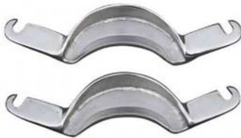
Equine Mouth Speculum Di-0018

Extra Wide Bite Plates This set of plates due to their semi circle shape prevent the incisors to come off the bite plate. The extra wide arms keep the speculum away from the equine's cheek making more working space for the technicians to use various angles to access the horse's mouth. For use with the Millennium speculum, the SE Speculum or the Hausmans.