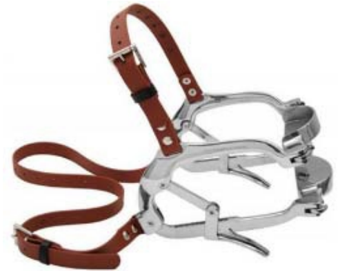
Equine Mouth Speculum Di-0023

Haumann Speculum This four ratchet speculum is ideal for day to day examination and dentistry procedures. The extra depth of the ratchets locks the speculum securely when horse's mouth is opened. Comes with biothene straps which are water proof and flexible to use. Available in normal or extra wide bite plates. This product comes with 10 years guarantee.