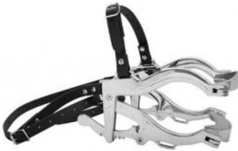
Equine Mouth Speculum Di-0021

SE Speculum with Biothene Straps 6 Ratchets A speculum with six ratchets setting for multiple opening options and the extra depth of the ratchets provides extra security to avoid unexpected closing of the speculum whilst on the horse's mouth. Comes with biothene straps which are flexible, easy to clean and use. Available in normal or extra wide bite plates. This product comes with 10 years guarantee.