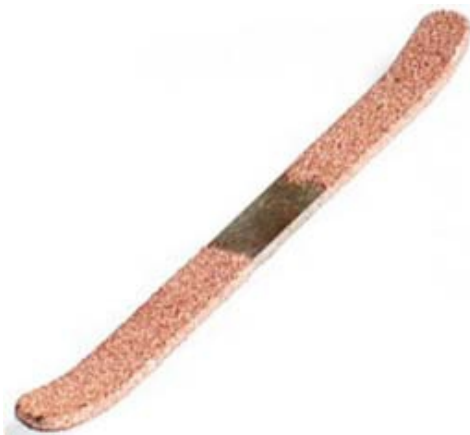
Gritted Float Di-0032

Diamond Gritted S Float 12" This float comes with a combination of concave and curved ends. They are coated double sided on the curved end and single sided on the concave end. S-Floats come in carbide chip or diamond grit. The body is made from stainless steel and the overall length is 300mm (12") long.