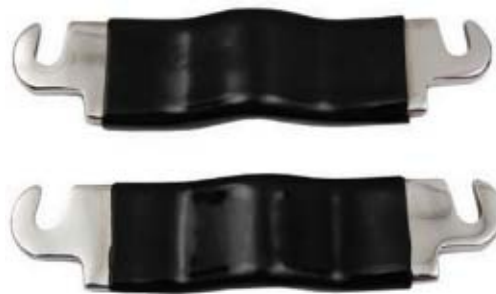
Equine Mouth Speculum Di-0019

Made up of polished forged stainless steel. Suitable for both Hausman Speculum and Millennium Speculum.