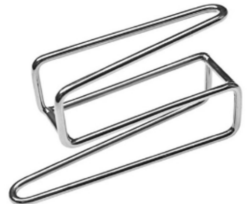
Equine Mouth Speculum Di-0026

Comes with ball and pin option. Insert between cheek teeth to hold incisors apart.