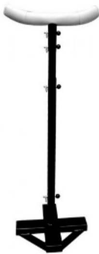
Equine Mouth Speculum