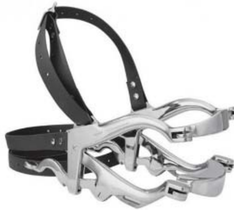
Equine Mouth Speculum Di-0022

SE Speculum with Biothene Straps 6 Ratchets A speculum with six ratchets setting for multiple opening options and the extra depth of the ratchets provides extra security to avoid unexpected closing of the speculum whilst on the horse's mouth. Comes with biothene straps which are flexible, easy to clean and use. Available in normal or extra wide bite plates. This product comes with 10 years guarantee.