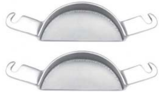
Equine Mouth Speculum Di-0017

Large Extra Wide Bite Plates Made from premium stainless steel, these bite plates are flat and very deep, making them great for mis-aligned incisors. The extra wide arms keep the speculum away from the equine's cheek making more working space for the technicians to use various angles to access the horse's mouth. For use with Millennium speculum, the SE speculum or the hausman's.