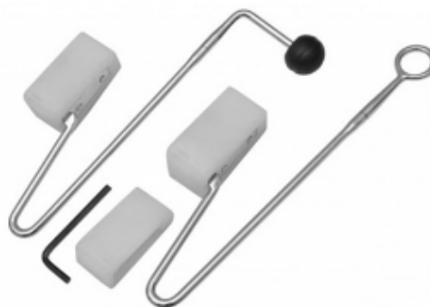
Equine Mouth Speculum Di-0025

Pony Speculum with Biothene Straps Ideal for small horses and ponies. This smaller size speculum enables the technicians to work as normal but with more secure fitting