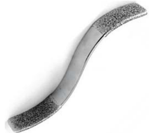
Gritted Float Di-0033

Handy Float Coated with an fine carbide grit, it has a very sharp cutting profile which creates an excellent finish for general filing and finishing work. The carbide grit form, totally coats both ends of the Handy Float making it extremely easy to control and use in hard to reach places.