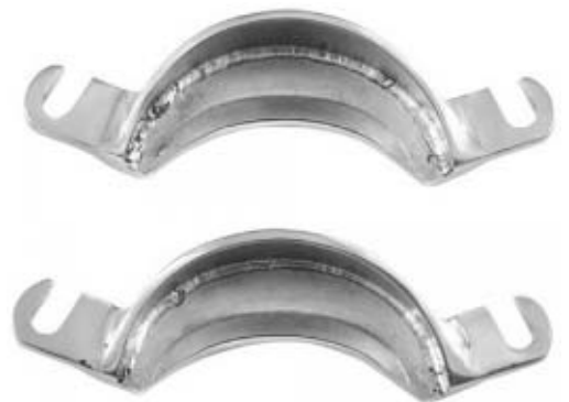
Equine Mouth Speculum Di-0020

Incisor Bite Plates Specially designed silicon coated plates are suitable for the horses with damaged incisors. For use with the