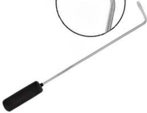
Dental Pick Di-0006

Lingual Buccal Long Head Dental Pick Its lingual and buccal application makes it ideal