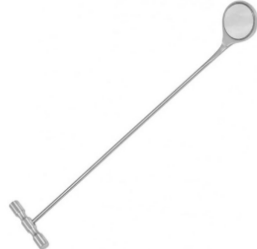
Dental Mirror Di-0003

75mm Diameter 25D Inclined Dental Mirror Dental mirror for examination purposes of equine mouth.