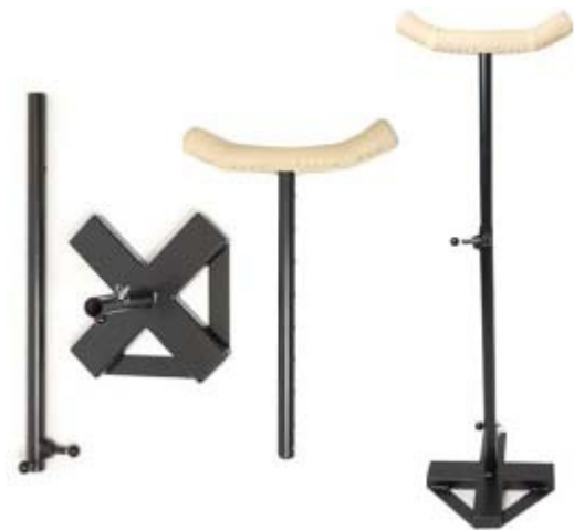
Equine Mouth Speculum

Equine Dental Head Stand This unit is easy to assemble, dismantle and to store away; it has a unique feature of a spring loaded height adjuster and locking system. The headrest is firmly padded and finished in fine quality leather and additional removable pvc cover (supplied) which is washable to aid hygiene.