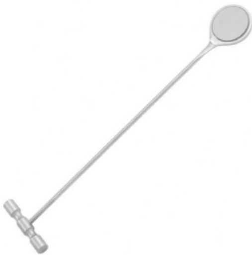
Dental Mirror Di-0004

50mm Diameter 25 Degree Inclined Dental mirror for examination purposes of equine mouth.