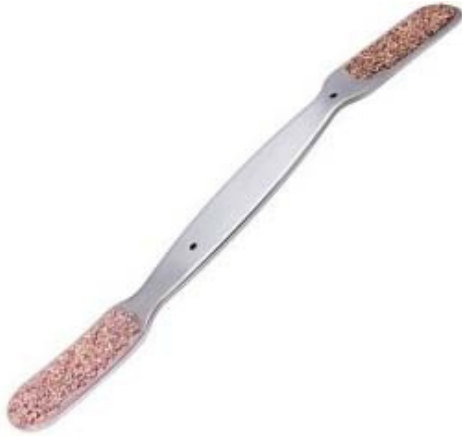
Gritted Float Di-0030

Carbide chip S Float 12" This float comes with a combination of concave and curved ends. They are coated double sided on the curved end and single sided on the concave end. S-Floats come in carbide chip or diamond grit. The body is made from stainless steel and the overall length is 300mm (12") long.