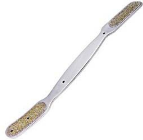
Gritted Float Di-0031

Carbide chip S Float 12" This float comes with a combination of concave and curved ends. They are coated double sided on the curved end and single sided on the concave end. S-Floats come in carbide chip or diamond grit. The body is made from stainless steel and the overall length is 300mm (12") long.