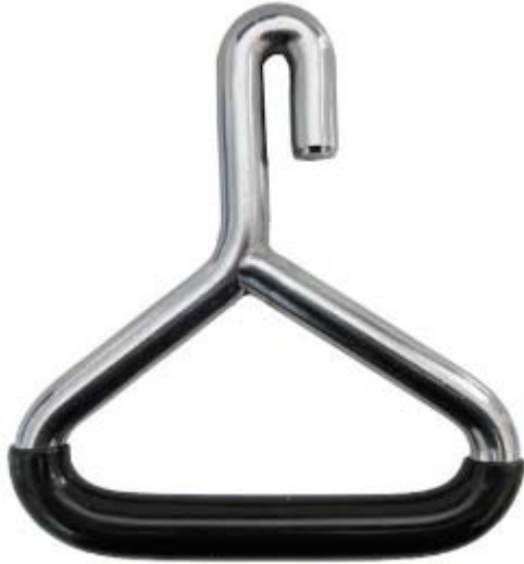
Handle Di-0092 Stainless steel, rubber grip.