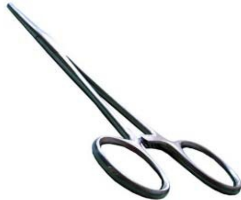
Artery forceps - straight Di-0175 5 1/2", straight, stainless steel