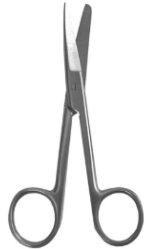
Operating Scissors - Curved Sharp/Blunt Di-0127 Stainless steel, curved, 5 1/2"