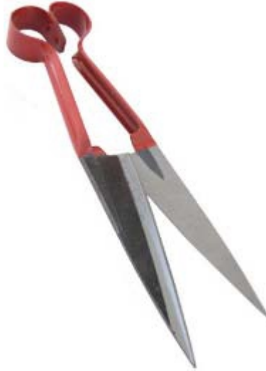
Sheep Shears Di-0071 6 1/2" long, red handle 6 1/2",