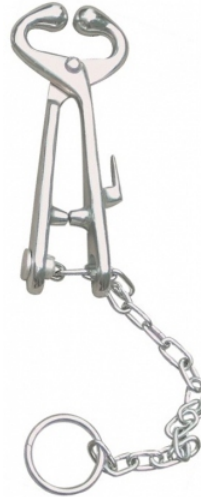
Bull Holder With Chain Di-0198 Bull Holder With Chain