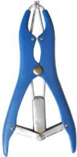
Band Castrator - Blue