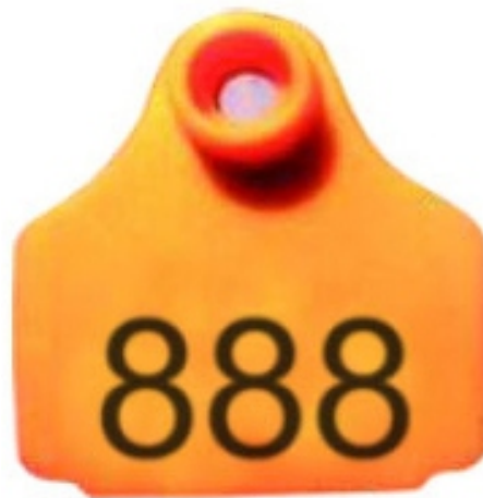
Ear Tag Printed (small) Di-0223