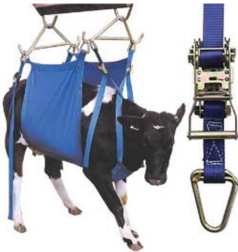
XL Daisy Heavy Duty Cow Lifter Di-0194

New improved Daisy Lifter Cow Lift is a simple and inexpensive way to lift or move cows with a front end loader or bucket. Gentle lifting with support from the backside to the brisket, ensures that the cow is not