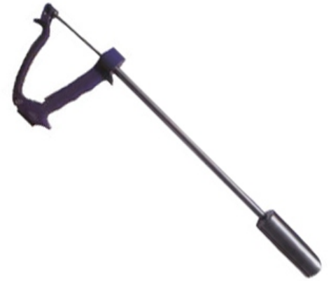
Bolus Gun Large Straight XL Di-0215