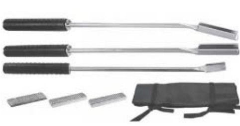
Float Kit Di-0177

Basic Float Kit Kit includes float SH1, SH5, No 26 and 3 corresponding blades to fit in package floats. you also have an option to select any 3 floats from our range and the price will be charged at £270.00