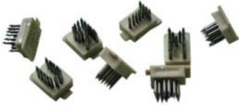
Set of Letters Di-0066

31-028 3/8" A - Z fits small pliers 31-030 5/16" A - Z fits standard pliers