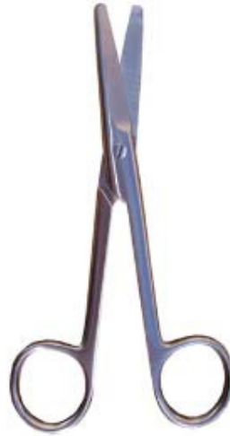
Operating Scissors - Curved Blunt Di-0126 Stainless steel, curved, 5 1/2"