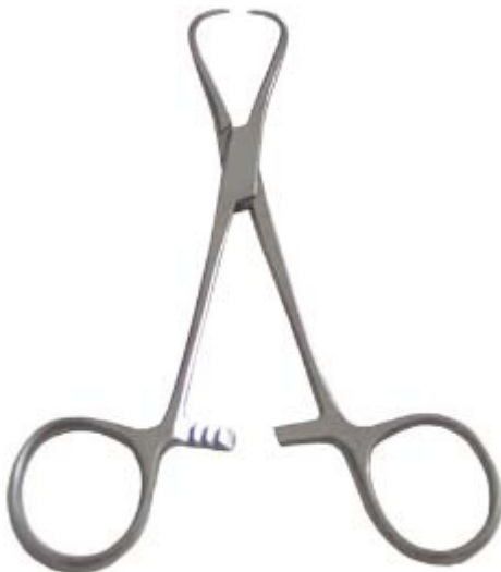
Backhaus Towel Clamp