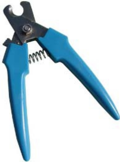
Dog nail clippers