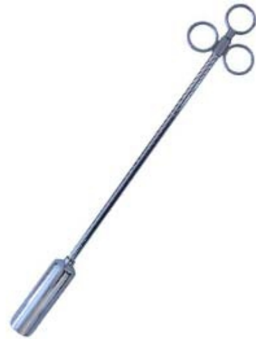
Metal head Di-0045

18" long, w/ spring, 1/2" metal head, carbon steel 1/2, 18,