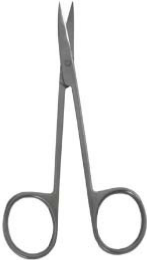
Iris Scissors - Curved