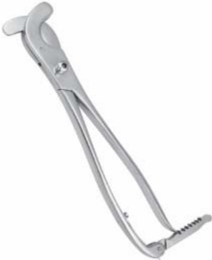
Sand s Castration Clamp 12.5" Di-0203 Sand s Castration Clamp 12.5" 12.5" ,