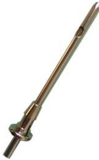
Infusion Tubes - 2 1/2 Di-0052 Rounded tip, stainless steel canula, brass chrome plated hub, two side opening, 2 1/2"long