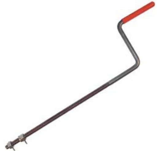
Crank Handle f/ Cow Lift Di-0193

Economical and durable, the improved Nordic Cow Lift is simple to use. Lightweight and self-locking, the lift tightens with a simple hand crank. Useful for everything from post-parturient paresis, down cow, and prolapsed uterus to surgery restraint, generalized weakness, obturator paralysis or fracture repair. The self-locking rings will not slip outward as you jack them inward. Wt. 19 lbs.