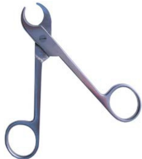
White Toe Nail Scissors

Economy stainless steel clippers with non-slip handles. Minimum effort for clean and smooth cut.