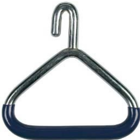
OB Handle Di-0188

(Neogen) Features same rugged construction as Dr. Franks, but with 2 pulling points that alternately advance to shift the pull from one leg to the other to "ease" the calf out. Two-piece cam jack has special easy release feature. Two-piece smooth shaft and wide cast aluminum breechen. Lightweight special strength aluminum construction makes it easy to handle.