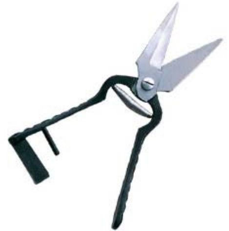
Sheep Shears Di-0072 Sheep Shears