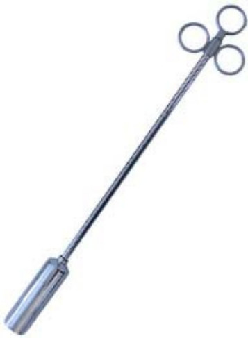
Metal head Di-0044

18" long, no spring, 1" plastic head 1, 18,