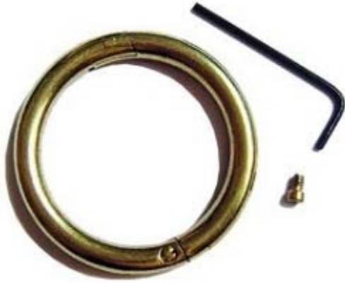
Bull Ring - Brass - Small 2 1/2" X 5/16"