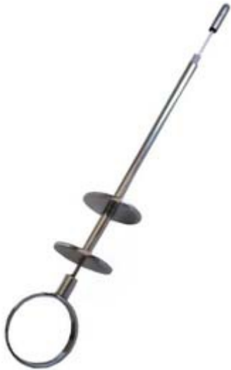
Hug's Teat Tumor Extractor Di-0051 Chrome plated, 7" long 7,