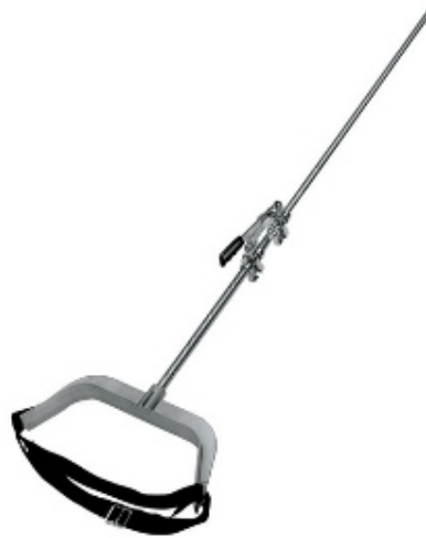
Ratch-a-Pull Dual Action Di-0186

(Neogen) Popular, dependable calf puller has stood the test of time. The cam jack moves easily on smooth shaft. Tension is released with the press of a lever. Has wide cast aluminum breechen, and two section shaft that can be disassembled for easy storage. 45" OB chain included.