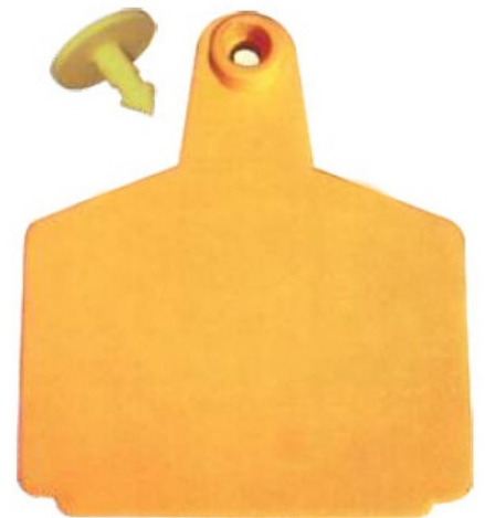
Ear Tag xl Di-0224