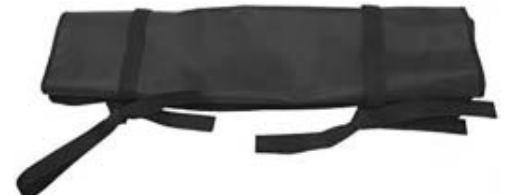
Float Kit Di-0182