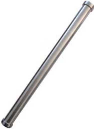
Frick Speculum Di-0047 20" long 20,