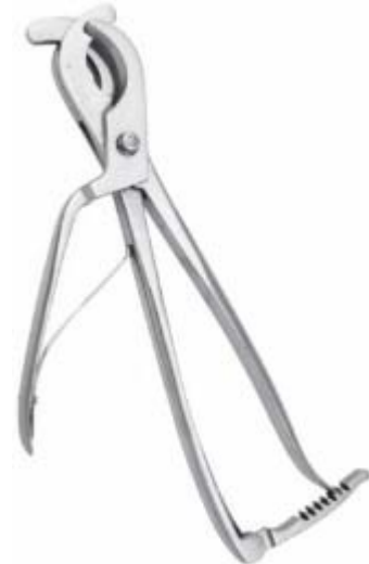
Reimer s Emasculator 13" Di-0204 Reimer s Emasculator 13" 13" ,