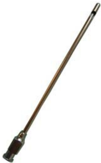
Infusion Tubes - 3 1/2 Di-0054 Rounded tip, stainless steel canula, brass chrome plated hub, two side opening, 3 1/2"long