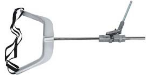
Calf EZE Dual Action Puller Di-0187

New, improved model double action puller. Refined milled grooves on shaft with no sharp edges. Wide cast aluminum breech spanner and longer solid shaft for those big calves. Puller disassembles for storage. Heavy-duty construction throughout. Order OB chains separately.