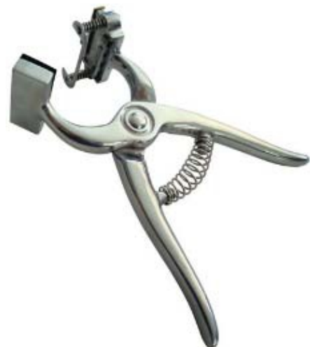
Standard Tattoo Pliers Di-0069

Holds up to five 5/16" digits. small, aluminum alloy