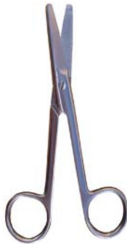
Operating Scissors - Straight Blunt/Blunt Di-0129 Stainless steel, blunt/blunt, straight, 5 1/2"