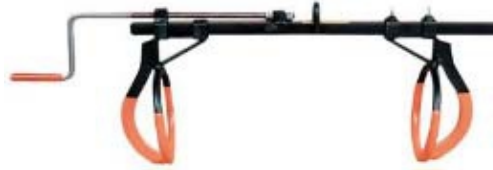
Cow Lift Di-0192

Beam Hook opens a full 10" to serve as a speedy, movable support for a sling or winch. Modern design features curved, pointed ends which easily grip overhead beam, tree limb, or pipe. The more pressure applied, the better the grip. The beam hook is a valuable companion piece to the Cow Lift. Load limit 1500 lbs.