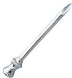
Milking Tube Di-0211