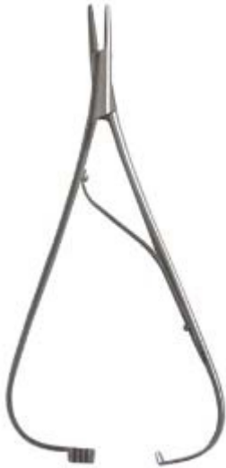
Mathieu Needle Holder Di-0159 Stainless steel. 7",