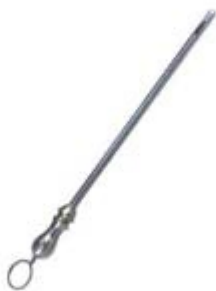
Milking Tube Di-0210