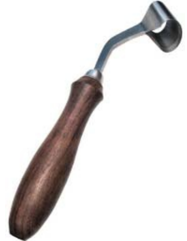
Swiss Knife Di-0088

Right hand hoof knife of superior quality with a 5/8" wide blade. Bakelite handles, stainless steel.