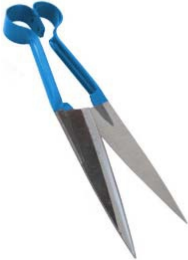
Sheep Shears Di-0070 5 1/2" long 5 1/2",