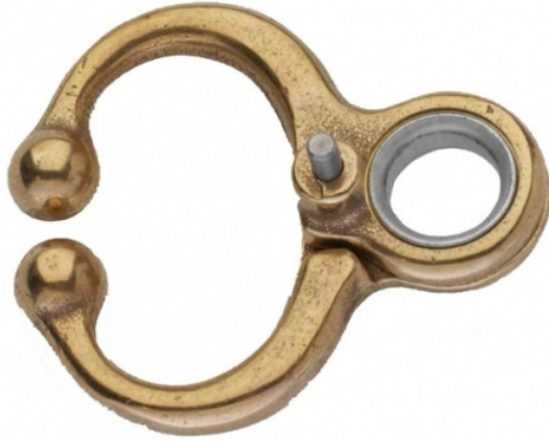
Brass Nose Leader Di-0197 Brass Nose Leader