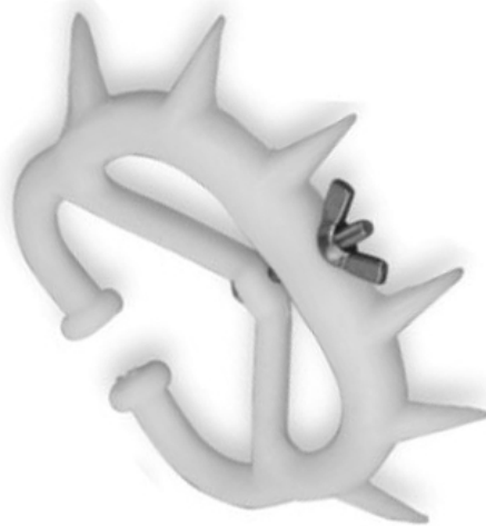
Plastic Milk Sucking Preventer Di-0226