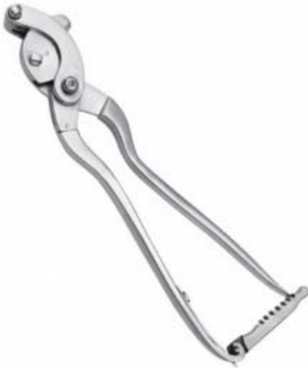
Serra Emasculator 14" Di-0205 Serra Emasculator 14" 14" ,