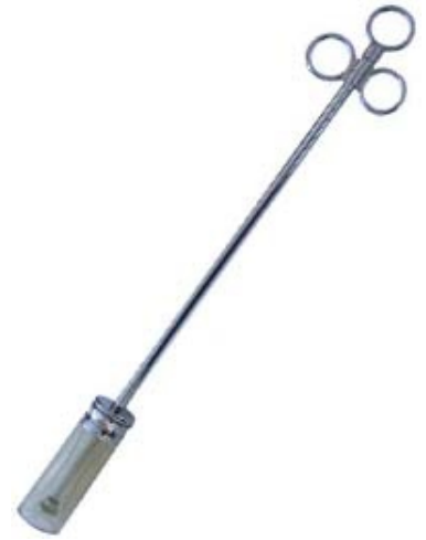
Plastic head (no spring) Di-0043

18" long, w/ spring, 1" plastic head 1, 18,