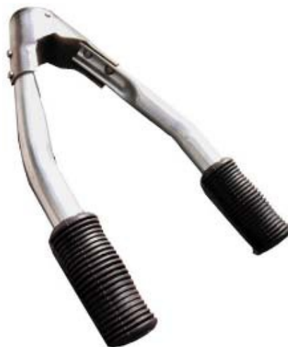
Barnes Dehorner Di-0176 32-850 13" long 32-851 17" long 20-848 13" long superior 20-849 17" long superior