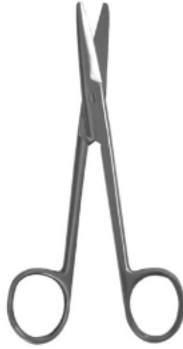
Mayo Scissors - Curved Di-0120 Stainless steel, curved, 5 1/2"