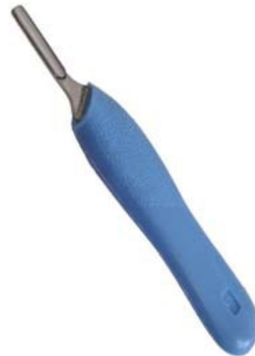
Scalpel Handle - Plastic grip Di-0106

Stainless steel, w/ plastic grip, reusable