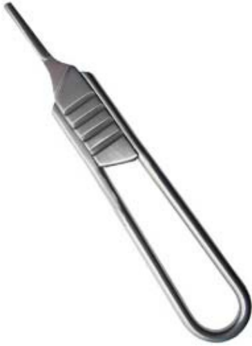
Folding scalpel handle Di-0102

Stainless steel 32-293 Leather sheath for folding handle