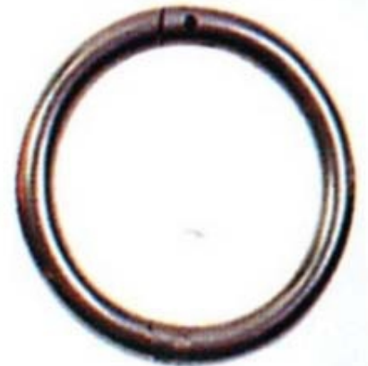
Bull Rings Di-0099 Bull Ring - Stainless - 3" x 3" ,