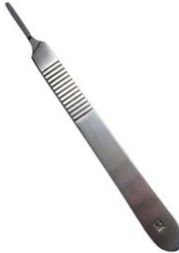
Scalpel Handle Di-0103

Stainless steel 32-293 Leather sheath for folding handle