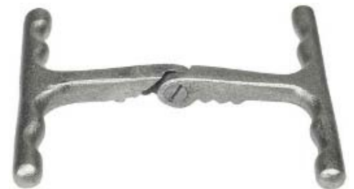
Wire Saw Di-0190

Easy grip two-handed pull design provides extra leverage. Hook will not spring or let chain slip.