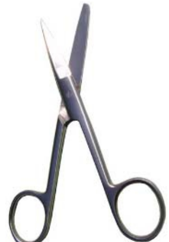
Operating Scissors - Straight Sharp/Blunt Di-0130 Stainless steel, straight, 5 1/2"