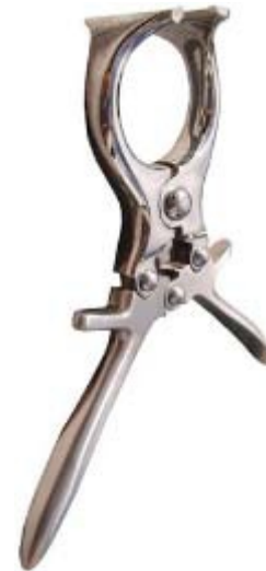
Lambs & piglets Di-0167