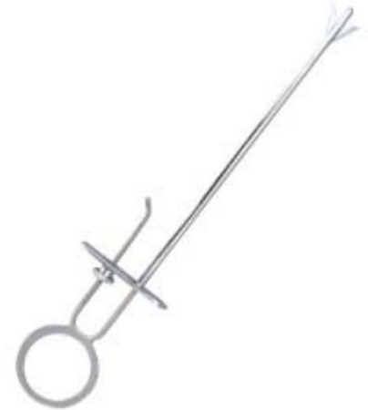
Danish teat Slitter Di-0209