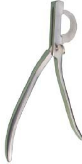
Extra crushing area Di-0165

12", w/extra crushing area, stainless steel