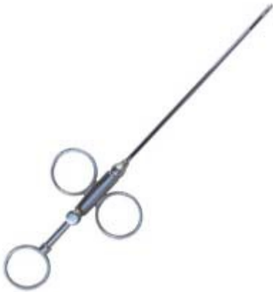
Teat Slitter Di-0207