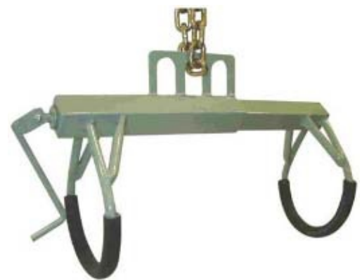
Rear Hiplift Di-0196

Front End Sling is recommended for use with the Hip Lifter especially in cases where the cow cannot support her front quarters. Use of the Hip Lifter alone could result in tissue damage. Front End Sling is adjustable for