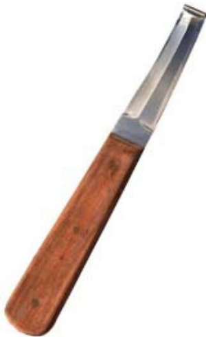
Wide blade - double edge 5/8 Di-0089

Double edge hoof knife with a 5/8" wide blade, stainless steel.