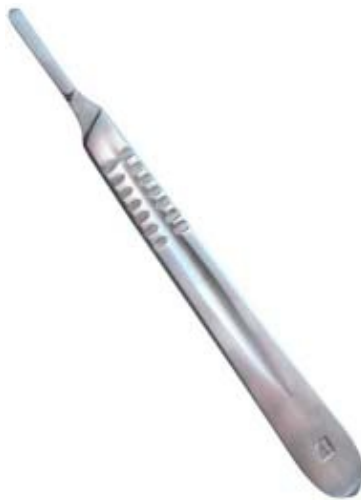
Scalpel Handle Di-0105

Stainless steel, w/ plastic grip, reusable