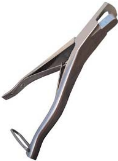
U type Stainless Di-0063

1/2" (12mm) V notch at base, medium 7" long, stainless steel 1/2,