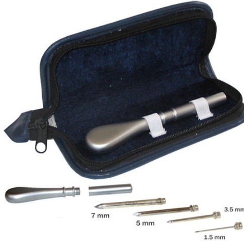
Trocar Kit Di-0152

Trocar w/ two cannula, stainless steel, 5 1/2" long