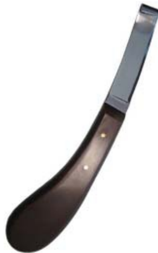
Superior narrow blade - right hand 3/8 Di-0084 Right hand hoof knife of superior quality with a narrow blade 3/8". Bakelite handles, stainless steel.