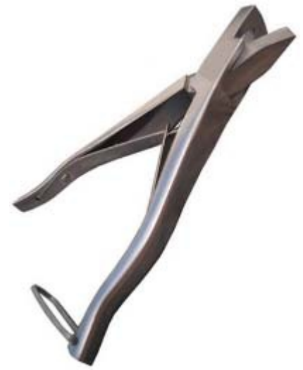
V type Stainless Di-0062

Medium 6 1/2" long, die cast aluminum, 1/2" (12mm) V notch 1/2,