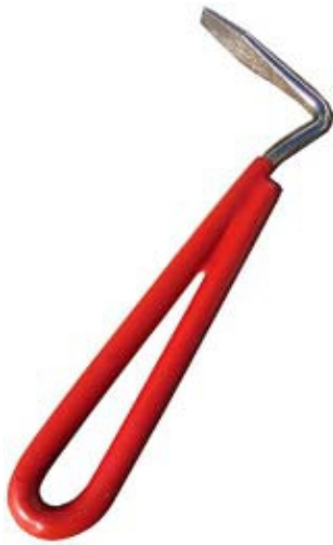
Hoof Pick Di-0080