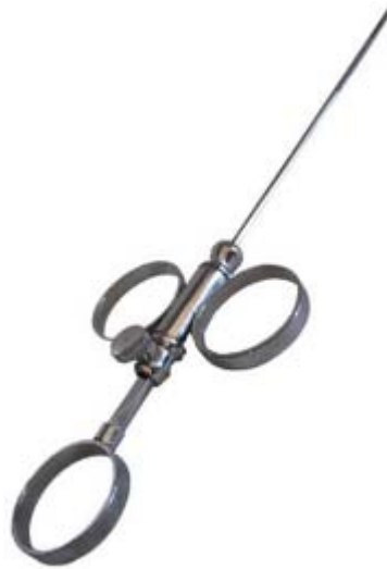
Teat Slitter - Double blade

Two side opening, 3 1/2" long, adjustable, stainless steel