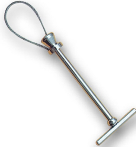
Pig Holder (small) Di-0229