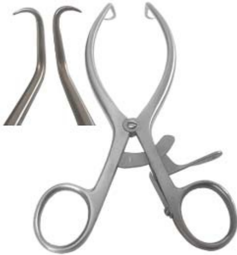
Gelpi Retractor Di-0144 7",