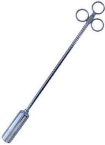
Metal head Di-0041

18" long, w/ spring, 1" metal head, carbon steel 1", 18",