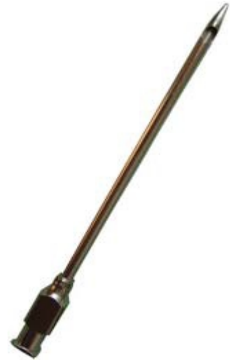
Infusion Tubes - 2.5 Di-0053 Pointed tip, 2 1/2" long