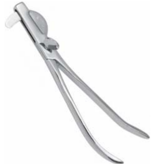
Verboeczy Emasculator 11" Di-0206 Verboeczy Emasculator 11" 11" ,