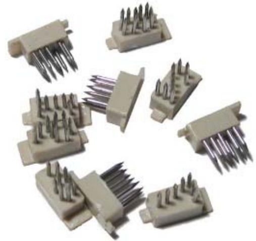
Set of Numbers Di-0067

31-028 3/8" A - Z fits small pliers 31-030 5/16" A - Z fits standard pliers