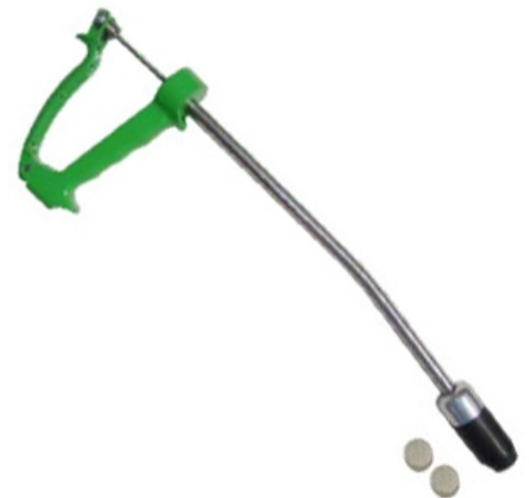
Sheep Calfmin Double Bolus Applicator Di-0218