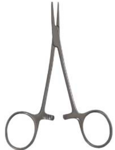
Halstead Mosquito - Straight Di-0112 Stainless steel, straight, 5"