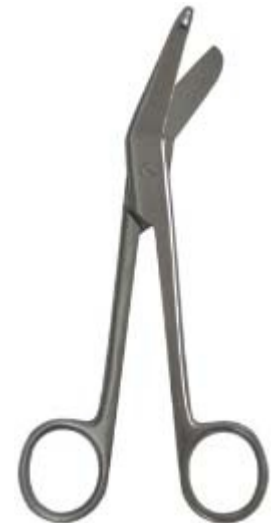
Lister Bandage Scissors