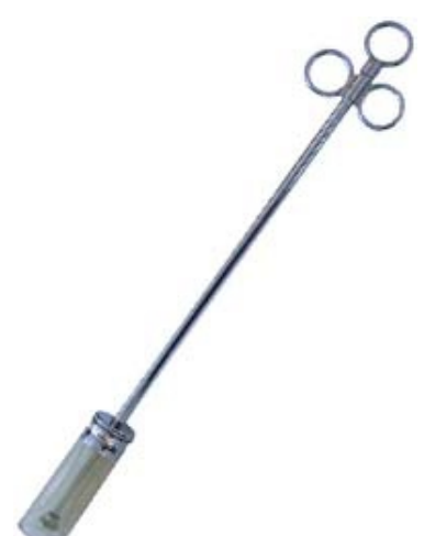
Plastic head Di-0046

18" long, w/ spring, 5/8" metal head, carbon steel 5/8, 18,