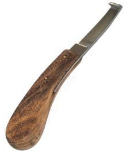
Narrow blade - right hand 3/8 Di-0082 Right hand hoof knife with a narrow blade 3/8", stainless steel.