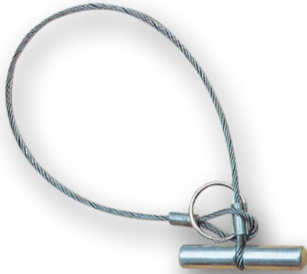
Pig Holder (30cm) Di-0228