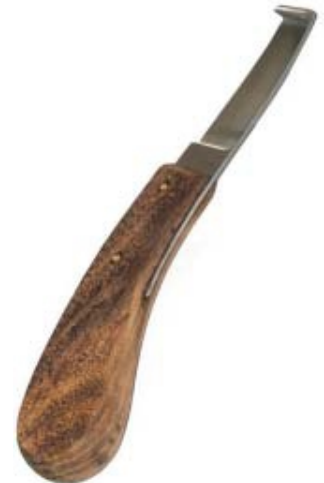
Wide blade - right hand 5/8 Di-0091

Left hand hoof knife with a 5/8" wide blade, stainless steel.