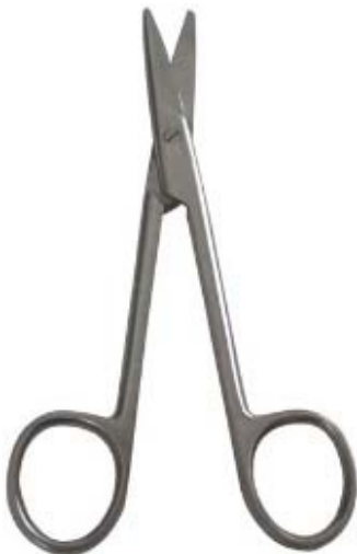
Mayo Scissors - Straight Di-0122 Stainless steel, straight, 5 1/2"