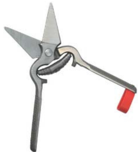
9 1/2" Long - Burdizzo type Di-0076 9 1/2" long, Burdizzo type