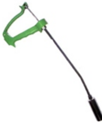
Bolus Gun Large Curved Di-0214