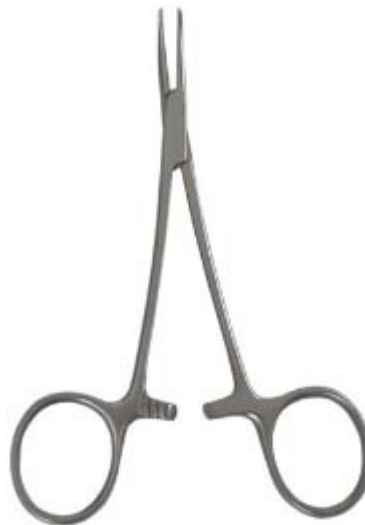
Halstead Mosquito - Curved Di-0111 Stainless steel, curved, 5"