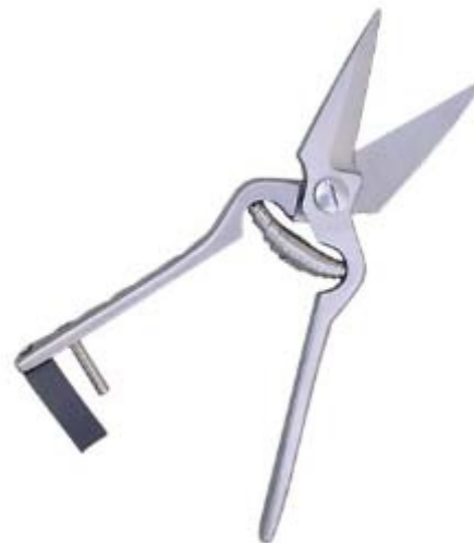
Sheep Shears Di-0074 Sheep Shears