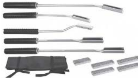
Float Kit Di-0178

Basic Float Kit Kit includes float SH1, SH5, No 26 and 3 corresponding blades to fit in package floats. you also have an option to select any 3 floats from our range and the price will be charged at £270.00