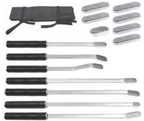
Float Kit Di-0179

Classic Round Shaft Float Kit Complete Kit includes float SH1, SH2, SH3, SH4, SH5, SH6 and 6 corresponding blades to fit in package floats. FREE DELIVERY ON THIS PACKAGE.