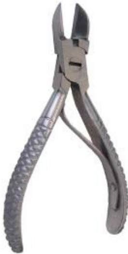
Pig Tooth Nippers Di-049 5 1/2" long, stainless steel 5 1/2",