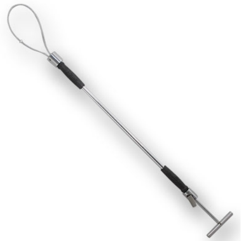
Pig Holder With Rubber Di-0231