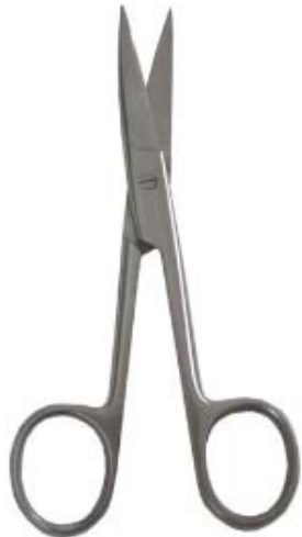
Operating Scissors - Curved Sharp/Sharp Di-0128 Stainless steel, curved, 5 1/2"