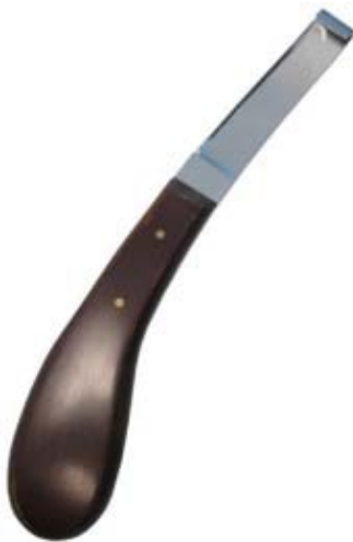
Superior narrow blade - left hand 3/8 Di-0083 Left hand hoof knife of superior quality with a narrow blade 3/8". Bakelite handle, stainless steel.