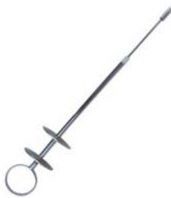
Teat tumor Extractor Di-0208