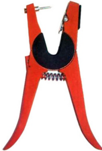
Ear Tag Plier (size 9.5") Di-0220