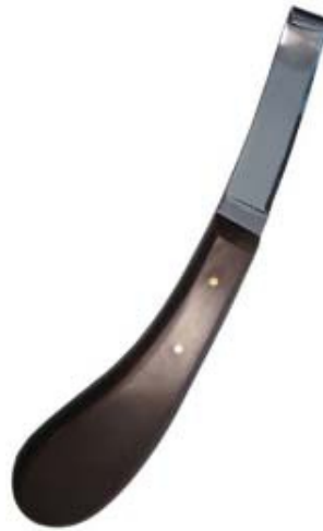
Superior wide blade - right hand 5/8 Di-0087

Left hand hoof knife of superior quality with a 5/8" wide blade. Bakelite handles, stainless steel.