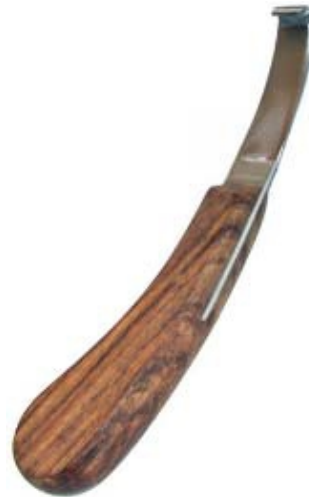
Narrow blade - left hand 3/8 Di-0081 Wooden handles, 3/8" narrow blade, left curved blade, stainless steel.