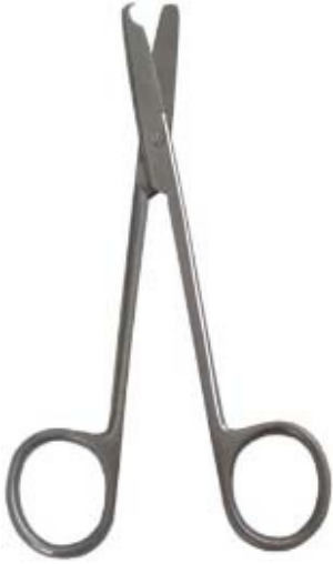
Littauer Stitch Di-0119 Stainless steel, 5 1/2"