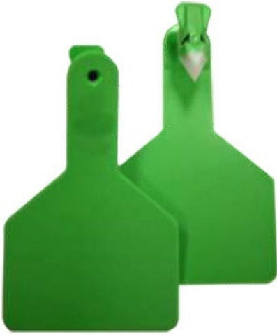
Ear Tag Di-0219