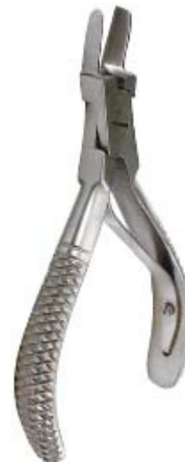
Pig Tooth Nippers Di-0150 5" long, stainless steel 5",