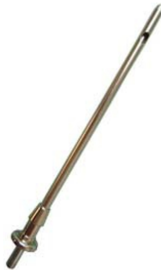
Infusion Tubes - 3 Di-0055 Pointed tip, 3" long