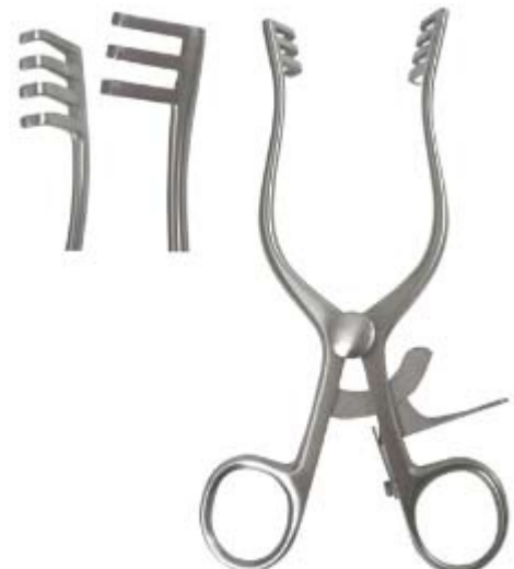
Weitlaner Retractor Di-0147 7",