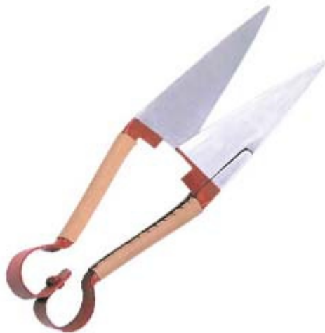
Sheep Shears Di-0073 Sheep Shears