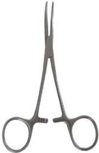
Crile Hemostat - Curved Di-0107 Stainless steel, curved, 6"