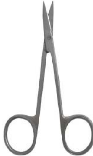
Iris Scissors - Straight