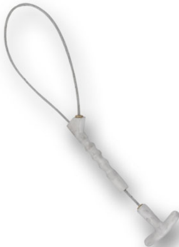
Pig Holder With Lock Di-0230