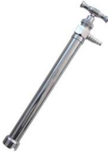
Stomach Pump Di-0048 17" long, Brass, chrome plated 17,