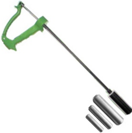
Bolus Applicator Straight Di-0213