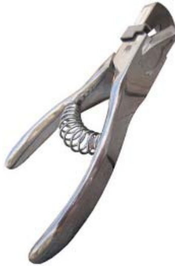
V type Aluminum Di-0061

1/2" (12mm) U notch at base, medium 7" long, stainless steel 1/2,