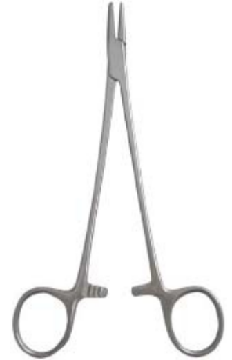
Mayo-Hegar Needle Holder Di-0161 Stainless steel. 7",