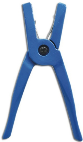
Ear Tag Plier Without Pin (size 9.5") Di-0222