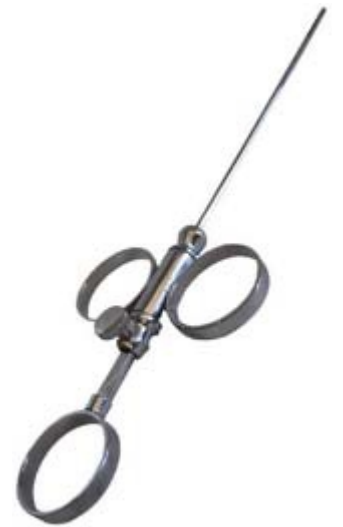
Teat Slitter - Single blade