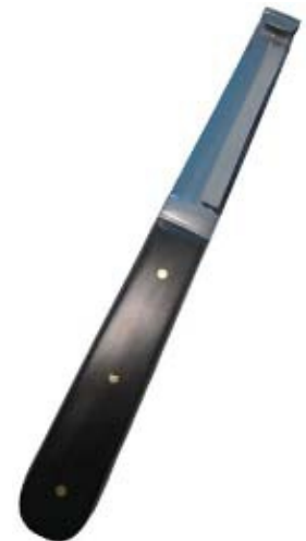
Superior wide blade - double edge 5/8 Di-0085 Double edge hoof knife of superior quality with a 5/8" wide blade. Bakelite handles, stainless steel.