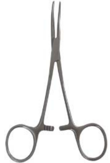
Kelly Hemostat - Curved