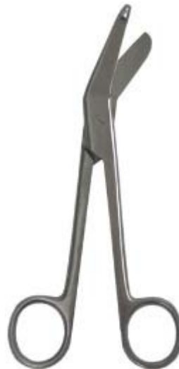
Lister Bandage Scissors