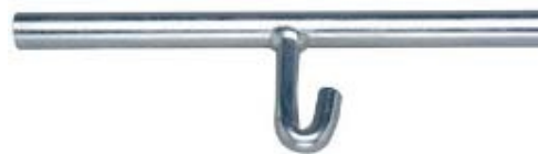
OB T-Bar Handle Di-0189

Hook, nickel finish, is designed to grasp chain firmly at any length.