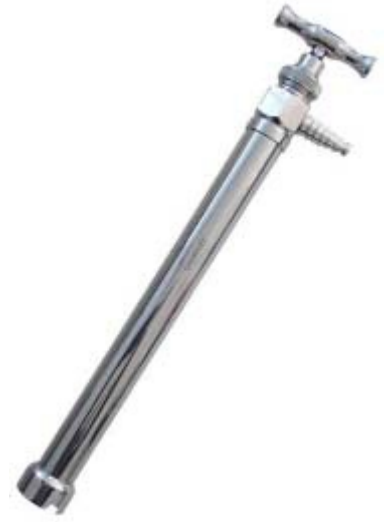
Stomach Pump Di-0049 21" long, Brass, chrome plated, Large 21,