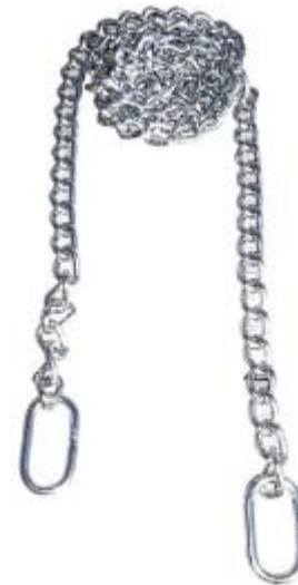
O.B. Chain Di-0093 32-780 30" long 76 cm 32-783 45" long 115 cm 32-781 60" long 150 cm