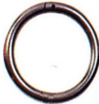
Bull Rings Di-0098 Bull Ring - Stainless - 2 1/2" x 2 1/2" ,