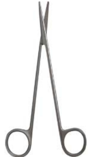
Metzenbaum Scissors - Curved Di-0124 Stainless steel, curved, 7"