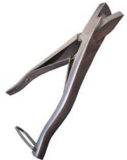
V type Stainless Di-0065

Large 9 1/2" long, die cast aluminum, 13/16" (20mm) V notch 13/16,