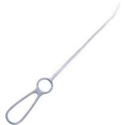
Bhuner Needle Di-0212