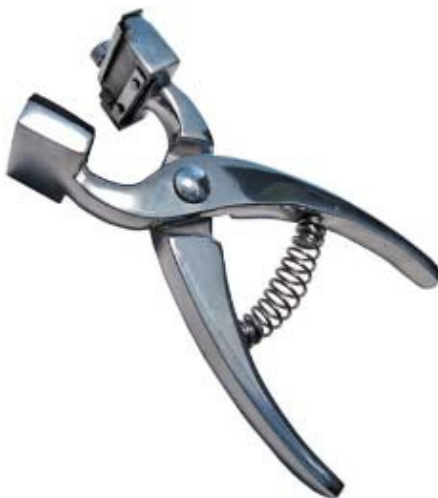
Small Tattoo Pliers Di-0068

31-027 3/8" 0 - 9 fits small pliers 31-029 5/16" 0 - 9 fits standard pliers