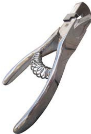
V type Aluminum Di-0064

3/4" (19mm) U notch at base, large 9 1/2" long, stainless steel 13/16,