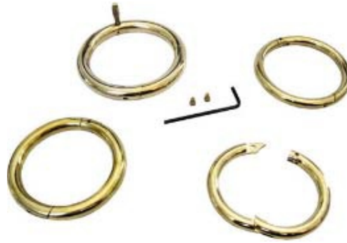
Brass ring Di-0095 5/16" x 2 1/2" ,