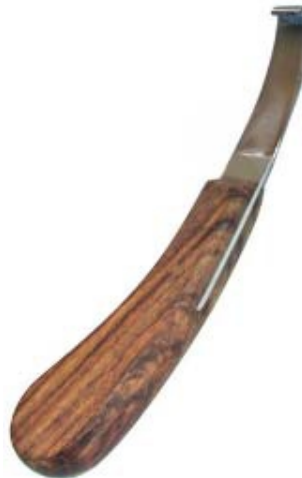
Wide blade - left hand 5/8 Di-0090

Double edge hoof knife with a 5/8" wide blade, stainless steel.