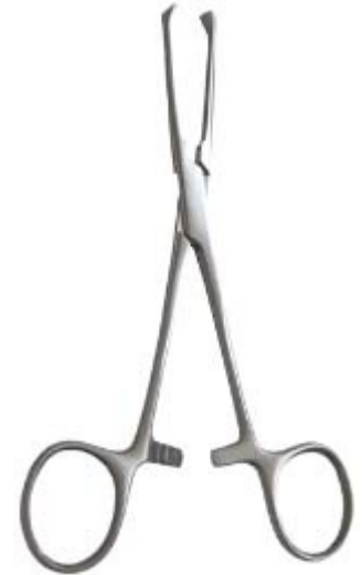
Allis Tissue Forceps

32-086 3 1/2" long shaft 32-087 5 1/2" long shaft 32-088 8" long shaft 32-089 12" long shaft