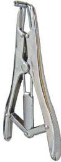
Band Castrator - Composite