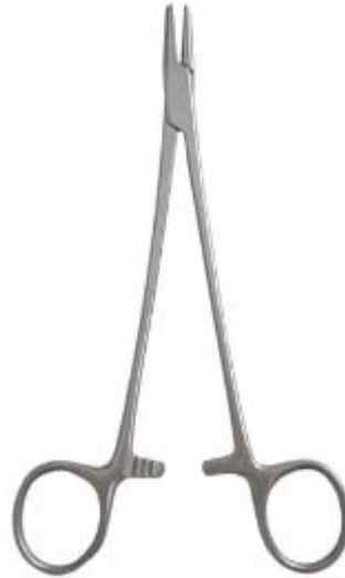
Mayo-Hegar Needle Holder Di-0160 Stainless steel. 6",