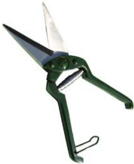
9 1/2 Di-0075 Interchangeable blades, 9 1/2 long