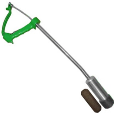
Large Bolus Applicator Curved Di-0216