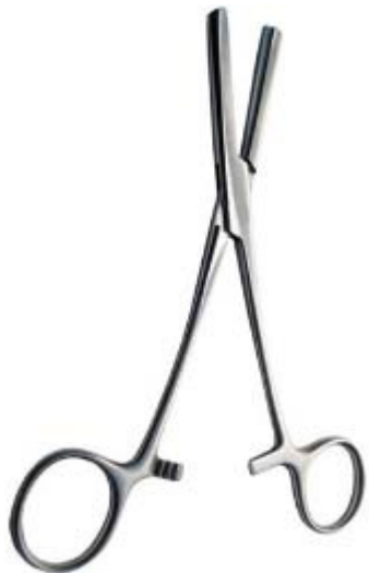
Ferguson Angiotribe - Straight Di-0110 Stainless steel, straight, 6 1/2"