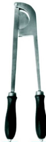
Tail Cutter Di-0155