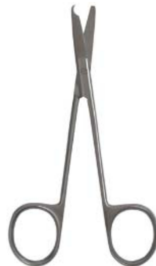
Spencer Stitch Di-0132

Stainless steel, sharp/sharp, straight, 5 1/2"