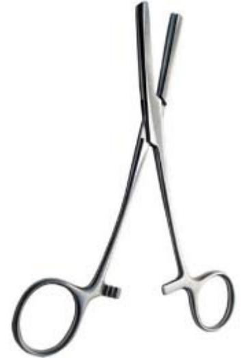
Ferguson Angiotribe - Curved Di-0109 Stainless steel, curved, 6 1/2"