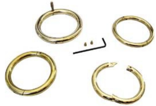
Brass ring Di-0096 5/16" x 3" ,