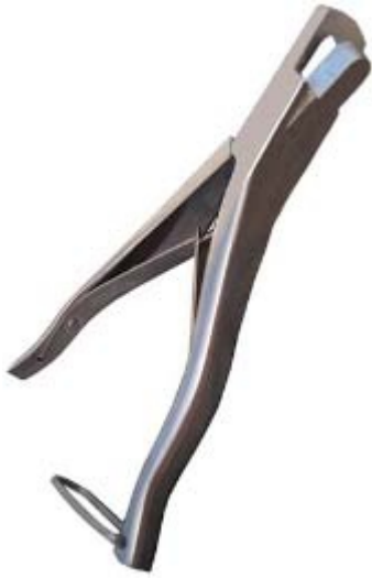
U type Stainless Di-0060

1/2" (12mm) U notch at base, medium 7" long, stainless steel 1/2,