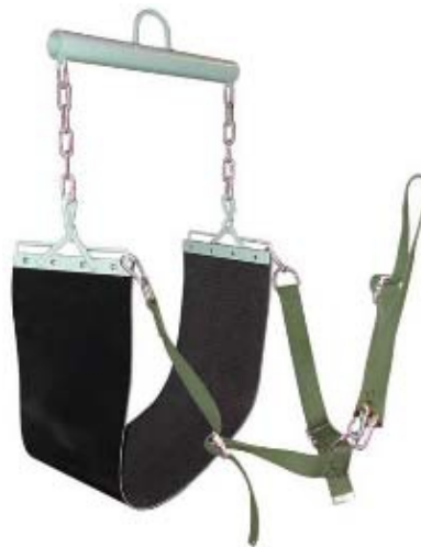
Front End Sling Di-0195

New improved Daisy Lifter Cow Lift is a simple and inexpensive way to lift or move cows with a front end loader or bucket. Gentle lifting with support from the backside to the brisket, ensures that the cow is not