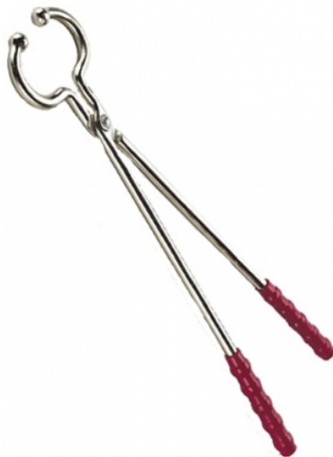
Bull Nose Tweezers 17" Di-0200 Bull Nose Tweezers 17" 17"