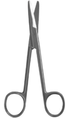
Mayo Scissors - Curved Di-0121 Stainless steel, curved, 6 1/4"