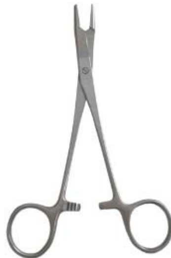
Olsen-Hegar Needle Holder Di-0163 Stainless steel. 7",