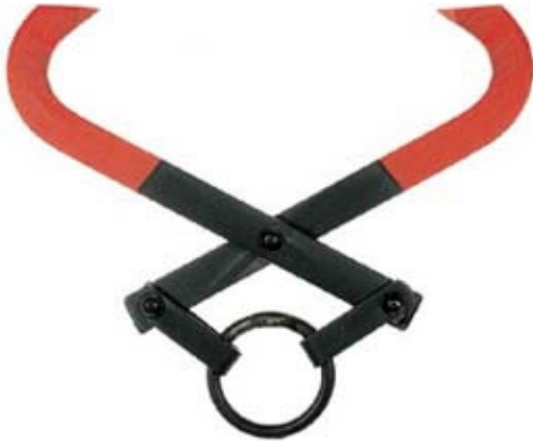
Beam Hook Di-0191

Beam Hook opens a full 10" to serve as a speedy, movable support for a sling or winch. Modern design features curved, pointed ends which easily grip overhead beam, tree limb, or pipe. The more pressure applied, the better the grip. The beam hook is a valuable companion piece to the Cow Lift. Load limit 1500 lbs.