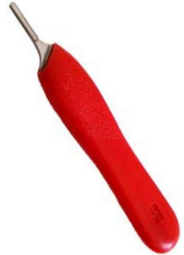
Scalpel Handle - Plastic grip Di-0104

Stainless steel, w/ plastic grip, reusable