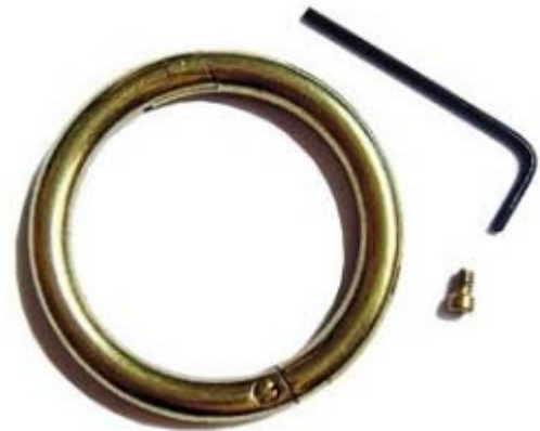
Bull Ring - Brass - Medium 3" X 3/8"

Bull Ring - Brass - Small 2 1/2" X 5/16" Small 2 1/2" X 5/16",