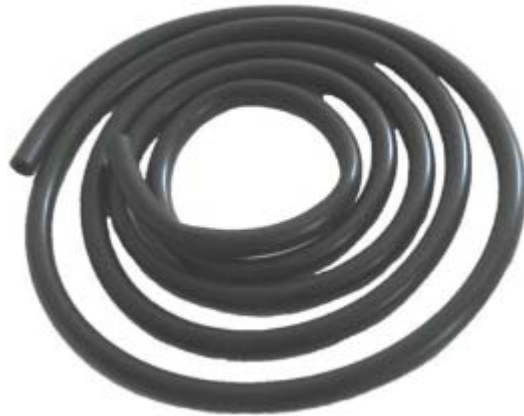
Tube Di-0050 Tube, 10' long, black, 5/8 OD, 3/8 ID 10,