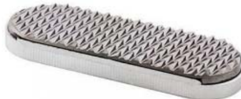
Float Kit Di-0181