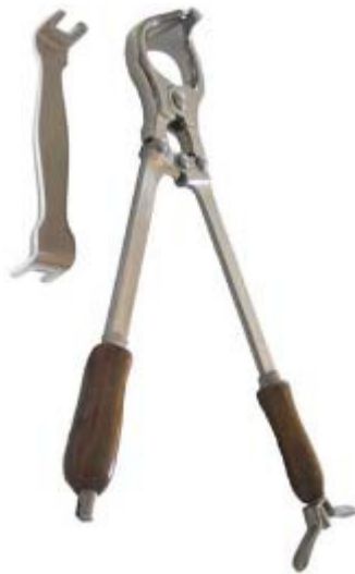
Mature horses & bulls Di-0166

12", w/extra crushing area, stainless steel