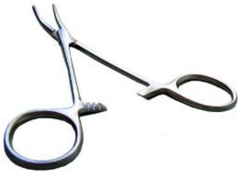
Artery forceps - curved Di-0174 5 1/2", curved, stainless steel