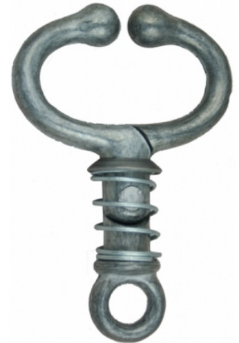
Bull Leader Di-0199 Bull Leader